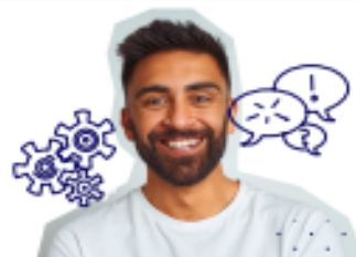
Wind turbine technician